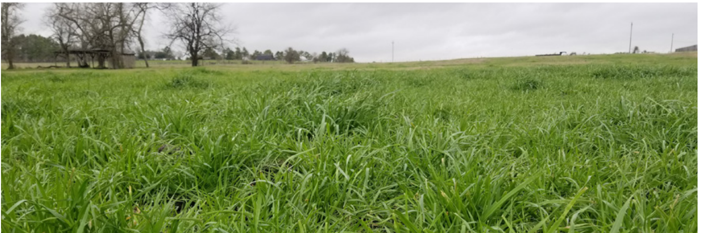
Annual Ryegrass Field

Plateau AgResearch and Education Center , Crossville, TN, 2018