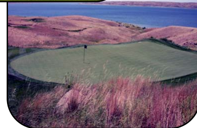
Scottish Links on roughs in China shown early and late summer